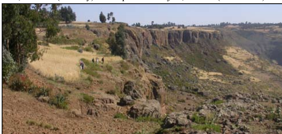
Walking along the escarpment near Mequat Mariam (November 2008)

(known as Abo) at Aterow. There are also other churches on the route and at the community sites where lunch is provided. While there is a concentration of festivals in late January, it is possible to plan a trip at other times of the year to coincide with a festival. The TESFA calendar is a perfect tool for such planning with all the important saints' days clearly shown on it.