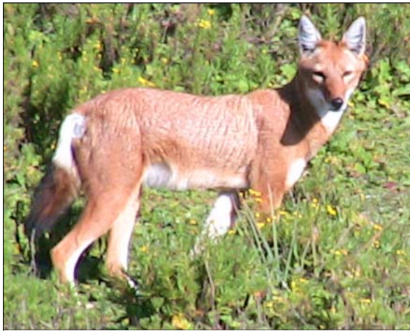
Ethiopian Wolf (in Gwassa)