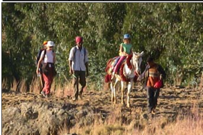
Meket trekking, a big hit with kids who love the horses