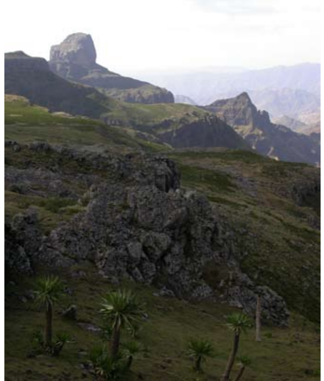
Giant Lobelia growing on Abuna Yoseph

T.E.S.F.A. plan to use this community tourism conservation mechanism, which we will pioneer on Abuna Yoseph, in other important areas of biodiversity such as Wof Washa forest and the afro-alpine moorland of the nearby Gwassa Menz - all in North Shoa.