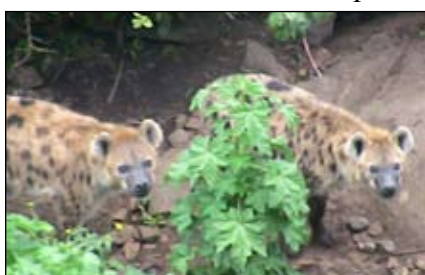
Spotted Hyenas, mostly nocturnal

But bigger animals are around too, the endemic Gelada Baboons, which are easier to spot after the harvest is over are all along the cliffs. Here and there are troops of cheeky Vervet Monkeys, and to my recent amazement I saw Hamadras Baboons up on the edge of Abuna Yoseph at over 3,200m. The local people refer to them as Netch Zingaro or White Baboons. Apparently they fight with the Gelada Baboons, and each use a different side of the ridge.