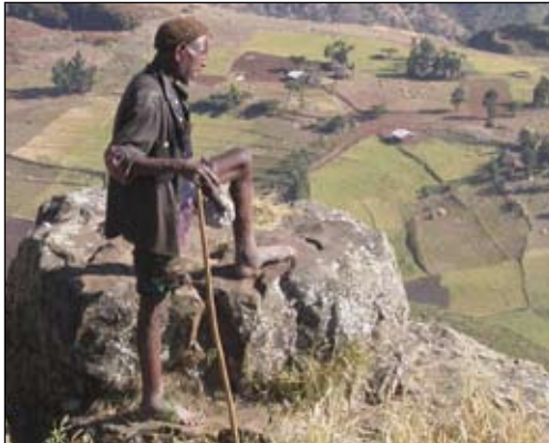
Mequat farmer surveys the landscape

As in previous years, the farmers of Mequat Mariam have had their land tax paid out of the profits from their tourism business. In addition the community is setting up a grain bank. While the construction of the grain