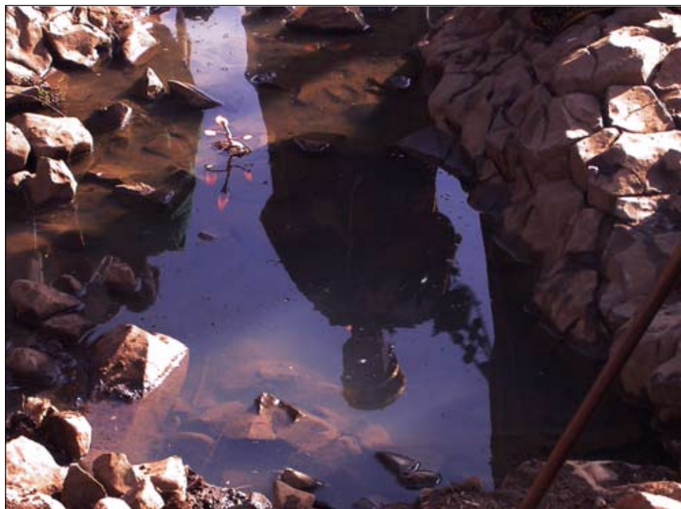
Spring water is blessed, Timkat celebration, Mequat Mariam (January 2009)

Easter is one of the most important dates in the church calendar but following the special mass that marks the end of the 55-day long Lenten fast, the festivities switch to the home where feasts are prepared and eaten with great gusto. The Ethiopian calendar has many other festivals. Many come in the month that follows Christmas. Timkat (the celebration of Jesus' baptism) is the most famous. This year guests of the communities were in the privileged position to join in celebrating Timkat on the 19th January and Mikael Timkat on the 20th. Others witnessed the special St.George's day festival